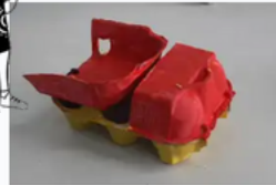
Transport – Land Transport